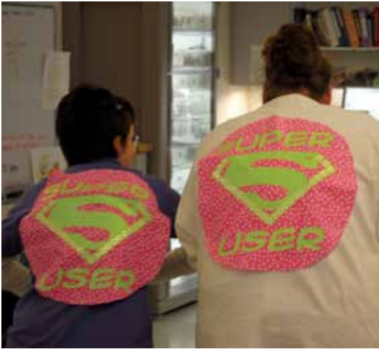
Our very own super user super heroes.