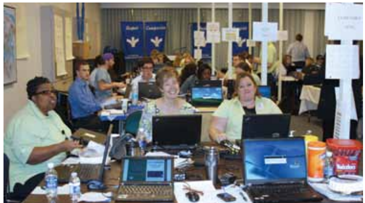
Command Center in the SMH auditorium provides monitoring and support for live ConnectCare system.

Go-Live at St. Mary's proved hugely successful because of the collective efforts of everyone! What a team!