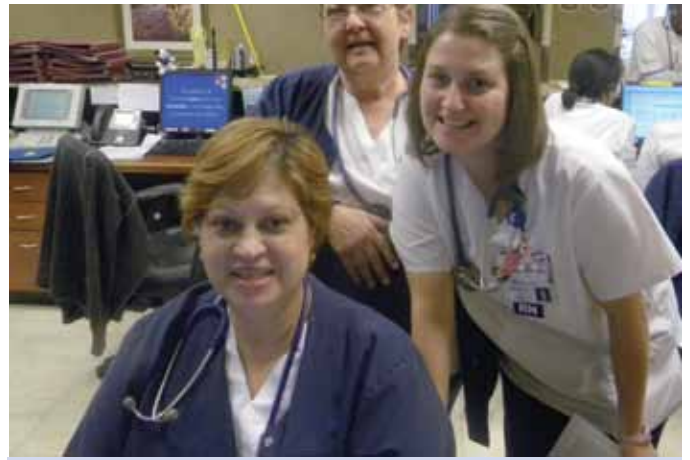
We love ConnectCare!