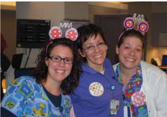
Nurses on pediatrics showing their ConnectCare enthusiasm.