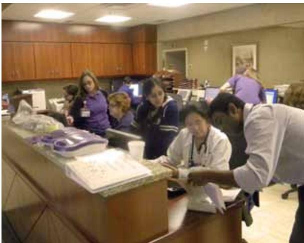
The team on 5west doing a great job partnering with the support team.