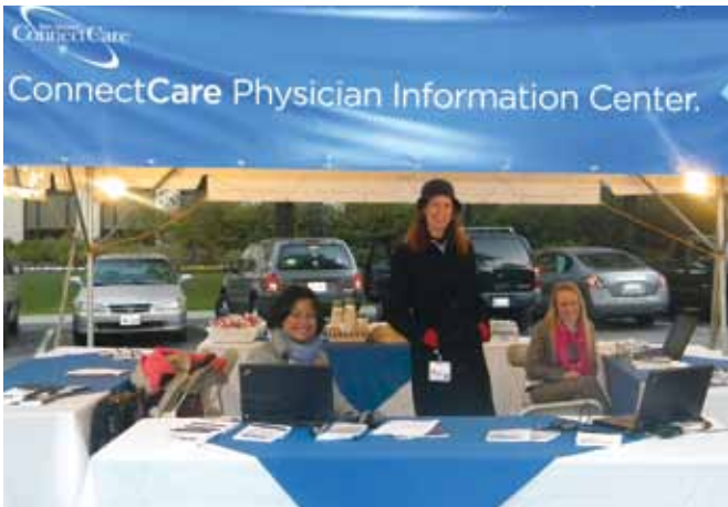
St. Mary's reaching out to physicians in multiple ways and places to assure they have what they need to be proficient with ConnectCare.