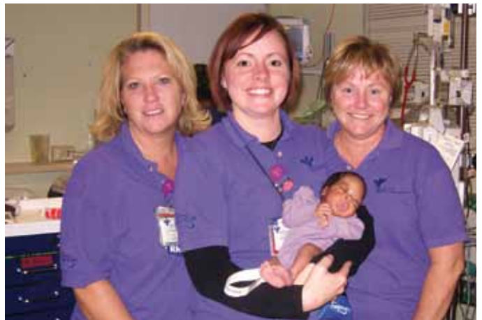
Support staff at St. Mary's Hospital and our newest fan of ConnectCare.