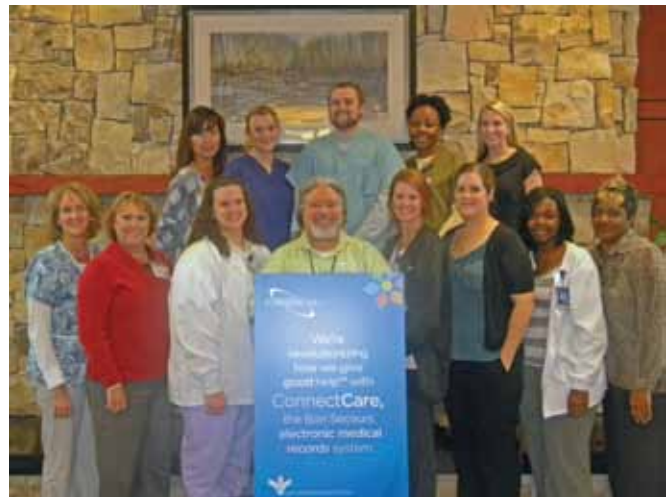
Reynolds Crossing Imaging Center is live with ConnectCare.