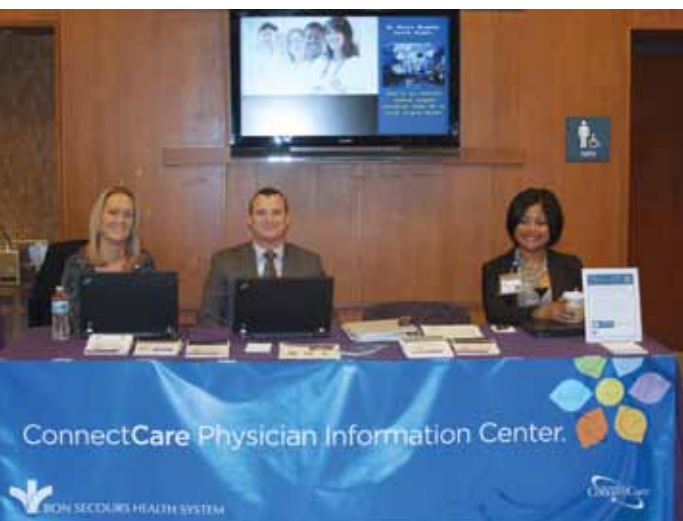
Physicians, need support? We have you covered!

Go-Live at St. Mary's proved hugely successful because of the collective efforts of everyone! What a team!